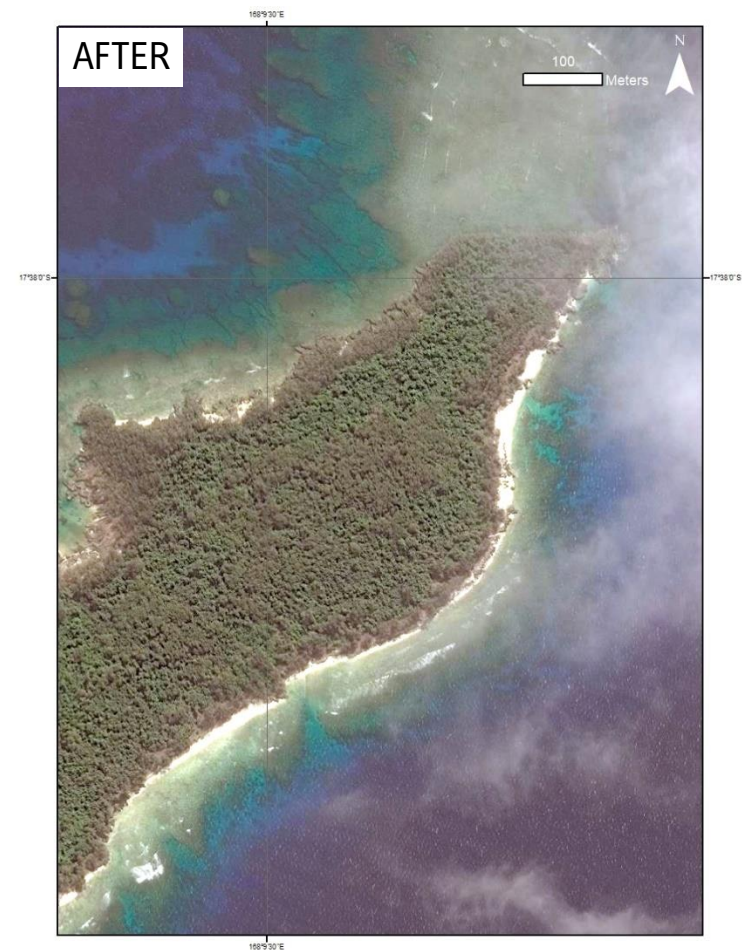
WorldView-2 / 23 APRIL 2020