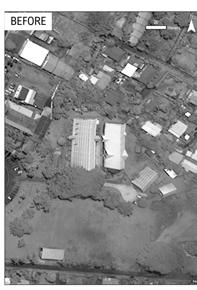
WorldView-1 / 31 MARCH 2020