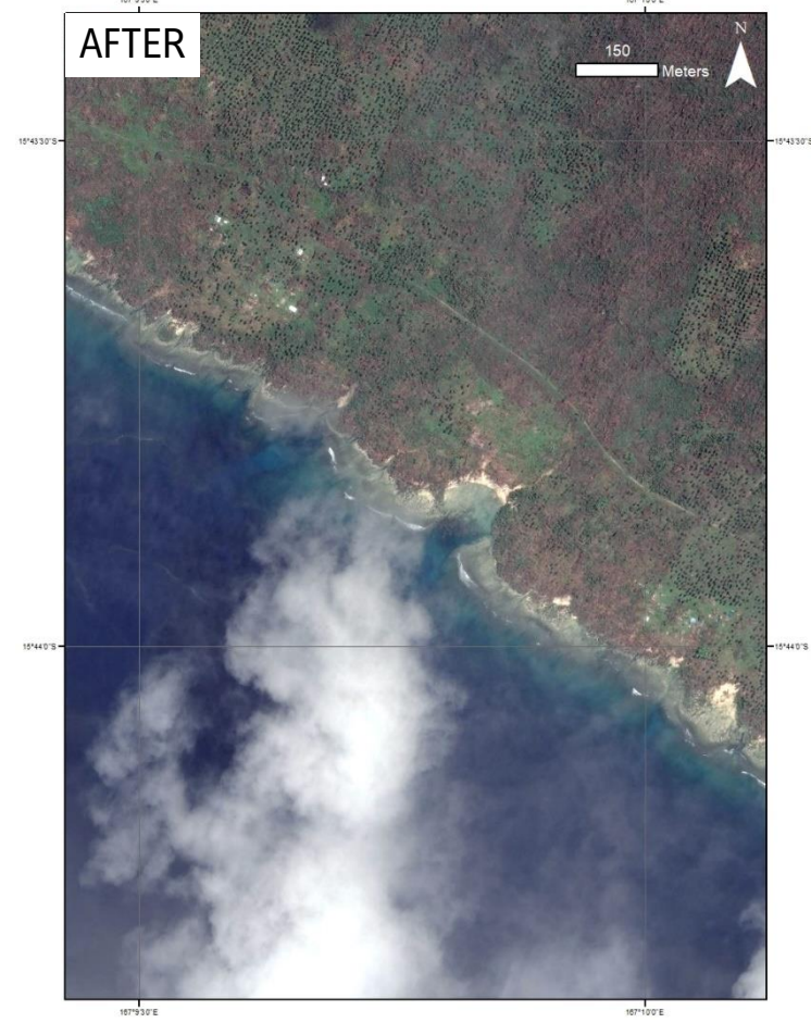
WorldView-2 / 20 APRIL 2020