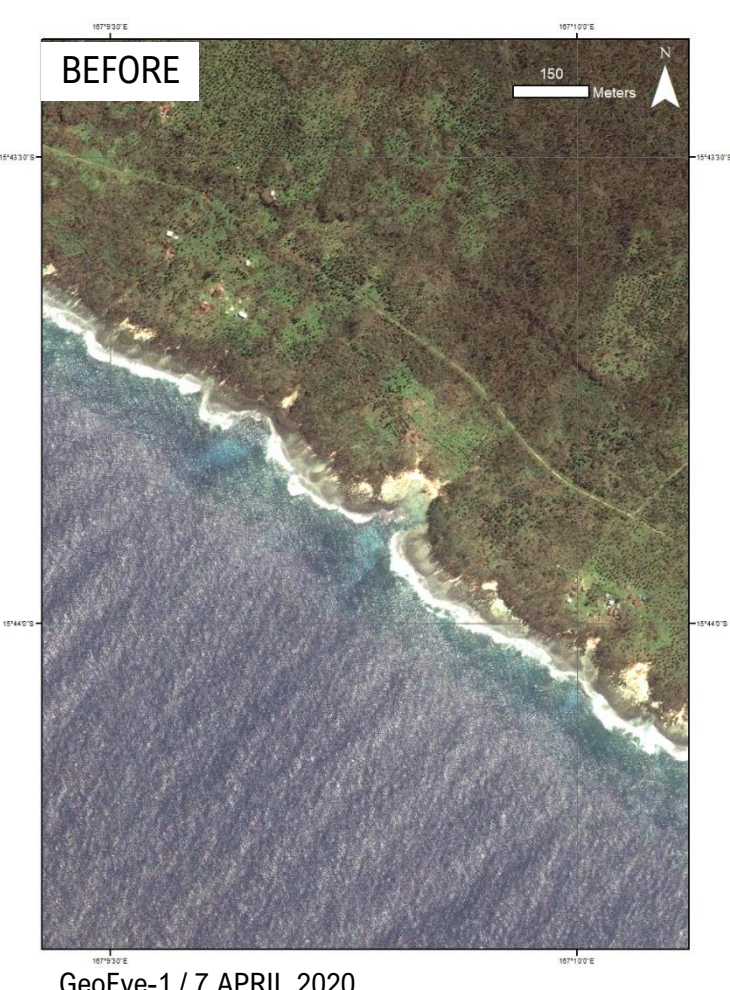
GeoEye-1 / 7 APRIL 2020