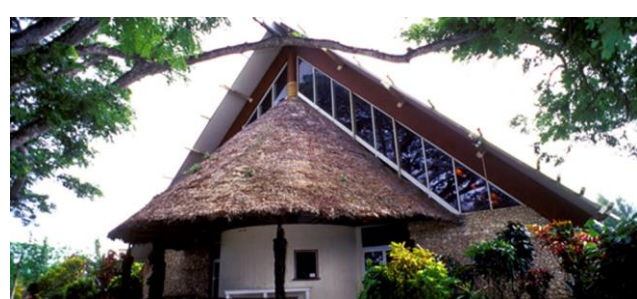
Location: 17°44'43.12" S, 17°44'43.12" E