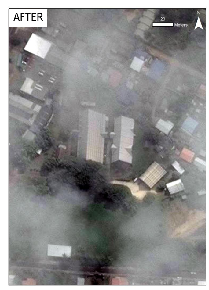
WorldView-2 / 23 APRIL 2020